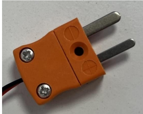
Figure 2 Thermocouple end of Element-B connection cable