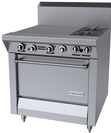
Model M43-2R Shown with Optional Backguard