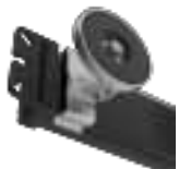
LMBSD50-180SMAG 180° magnetic clip bracket