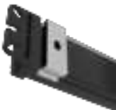
LMBSD50 Clip bracket