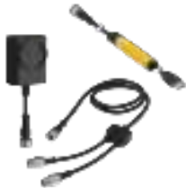
PRO-KIT Pro editor accessory kit for configuration of discrete models with Pro Editor software