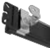
LMBSD50-180S 180° clip bracket