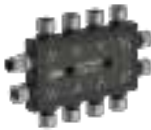
DXMR110-8K Multiprotocol eight port IO-Link Master