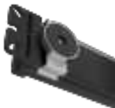
LMBSD50MAG Magnetic clip bracket