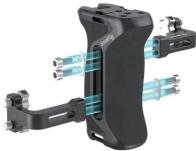
Left and Right Sides Available

Ergonomic design, and supports to be used by left & right hand interchangeably for improved grip experience.