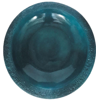
A. BIRDBATH TOP