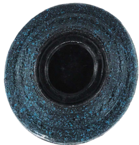
C. BIRDBATH BOTTOM