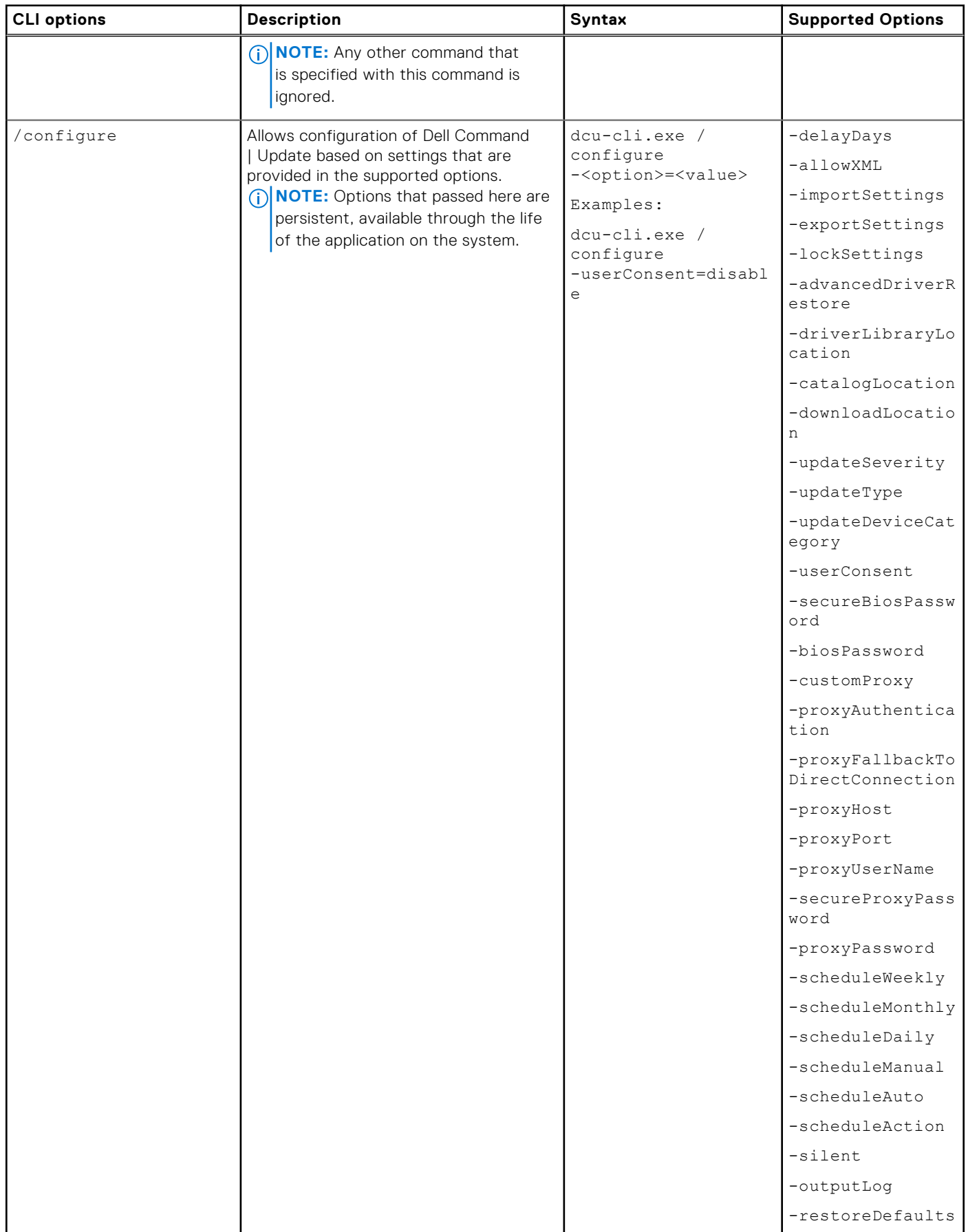
Table 1. Dell Command | Update CLI commands (continued)