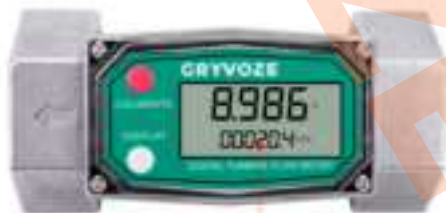
Total Cumulative Flow