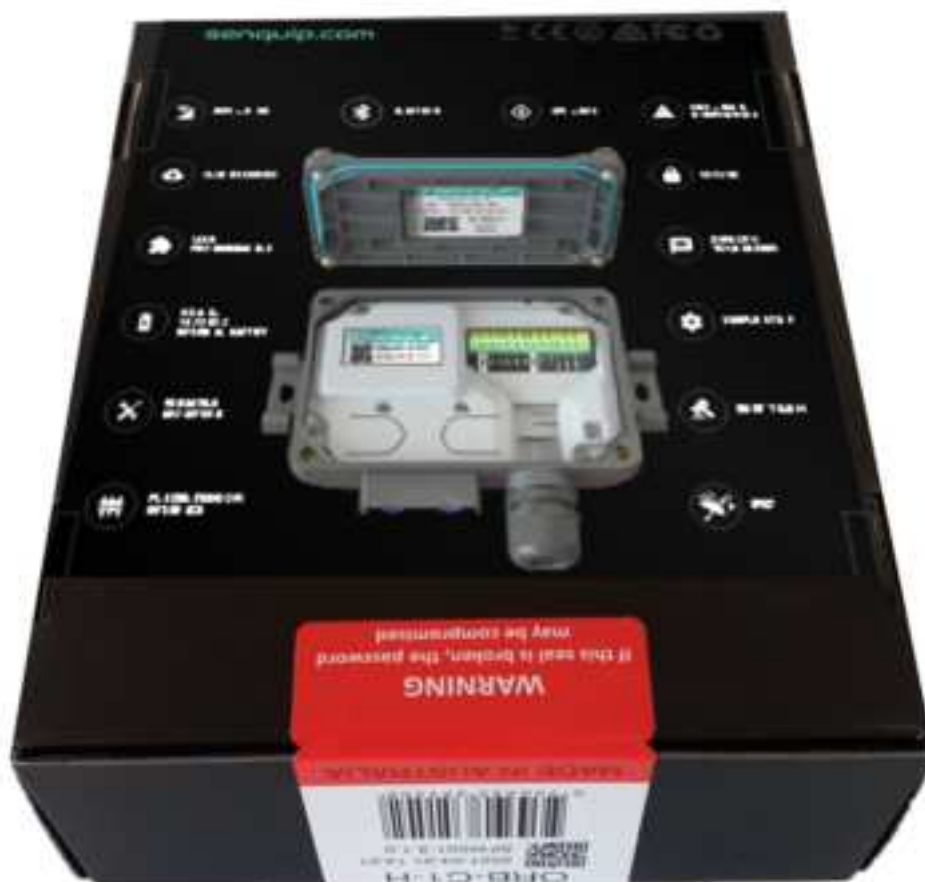
Figure 2.1. Senquip QUAD packaging with intact security seal

The Senquip QUAD is shipped in a box with a security seal that ensures that the packaging has not been opened. If this seal is compromised, the box may have been opened, in which case, a non-authorised party could have had access to the device password. If the device is to be used in a critical application, please ensure that the seal is intact upon receipt and remember to change your password as soon as possible.