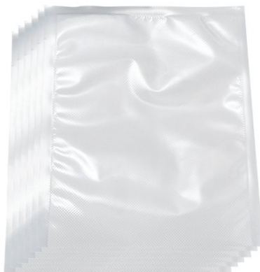
6 X REUSABLE VACUUM BAGS