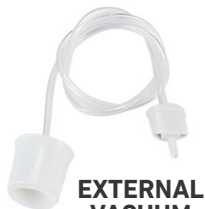
EXTERNAL VACUUM PIPE