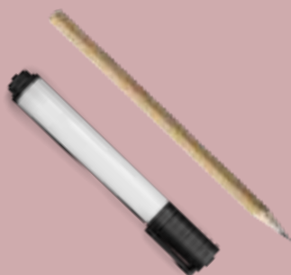
Pencil or Whiteboard Marker