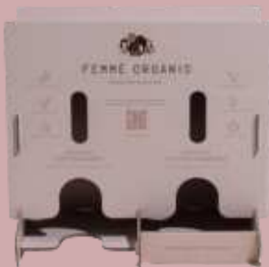
Femme Organic Bathroom Dispenser