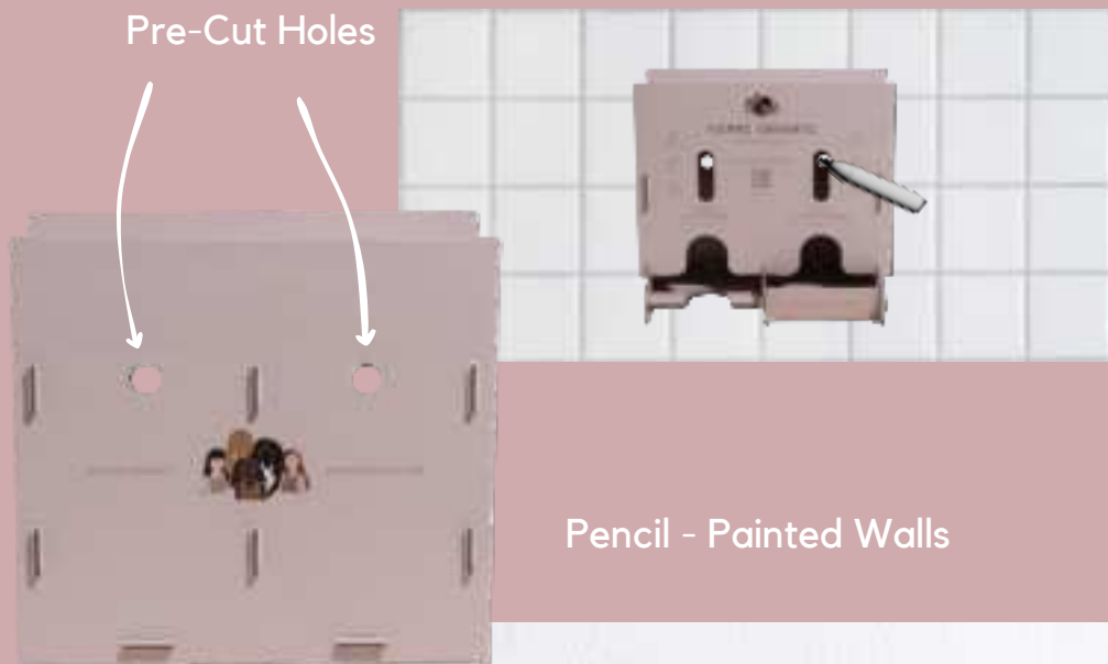
Pencil - Painted Walls