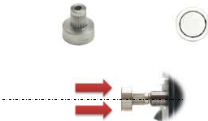
Figure 1: Magnet