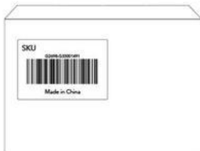
① Clear outer package (with sku label)