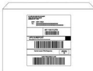
② Outer package waybill information