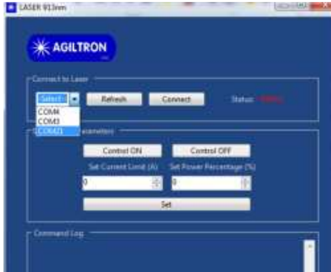
Figure 2: Remote control software: COM port selection