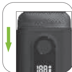
3. Assemble the Blade Heads Back to The Body

If you need to remove and wash the blades, it is recommended for a professional to operate and ensure all blades and blade meshes do not switch positions. Install them back into their original positions. Failing to do so may cause increased noise, weakened shaving effect, and uneven operation.