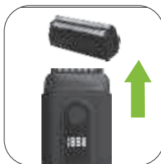
2. Detach the Razor Body