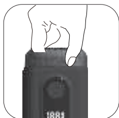
1. Pull Up