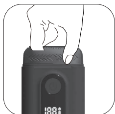
1. Pull Up