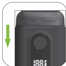
3. Assemble the Blade Heads Back to The Body

If you need to remove and wash the blades, it is recommended for a professional to operate and ensure all blades and blade meshes do not switch positions. Install them back into their original positions. Failing to do so may cause increased noise, weakened shaving effect, and uneven operation.