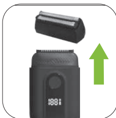
2. Detach the Razor Body