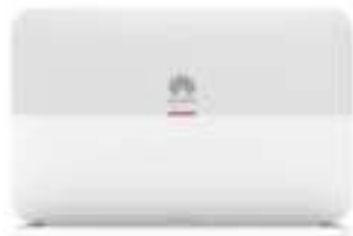
Huawei OptiXstar V183