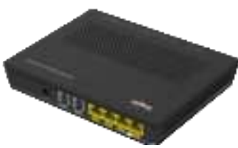
Huawei ONR (HG8244H)