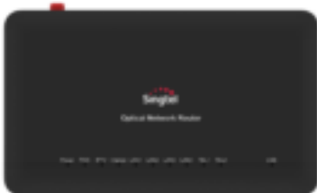
ZTE ZXHN F620