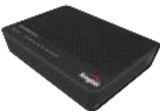
Huawei ONR (HG8240T5)