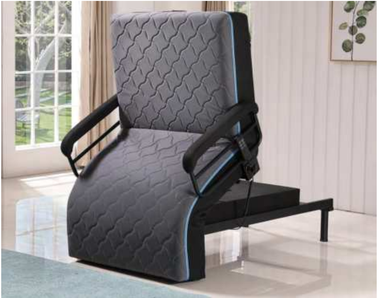
EZ-OUT BED (bed shown with optional guardrails)