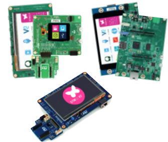
STM32F746G-DISCO, STM32F723E-DISCO, STM32F750B-DK, STM32H750B-DK