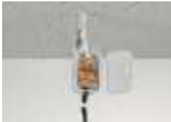
Pendant light connection in a suspended ceiling