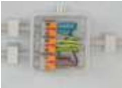
Wiring fine-stranded conductors in junction boxes.