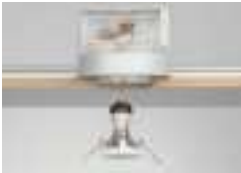
Custom low-voltage lighting system