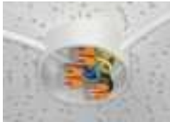
Lighting distribution in a ceiling canopy