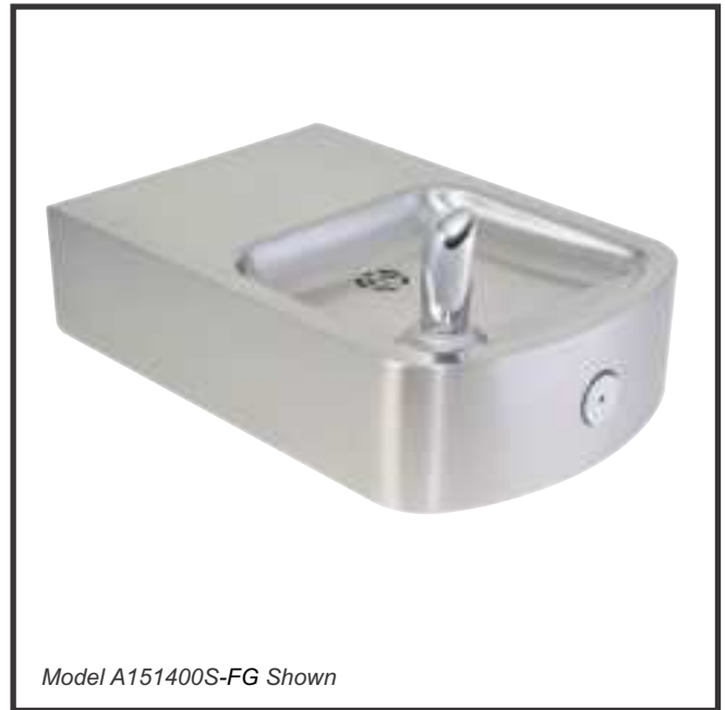
Model A151400S-FG Shown