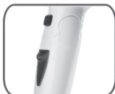
3 speed & cool air