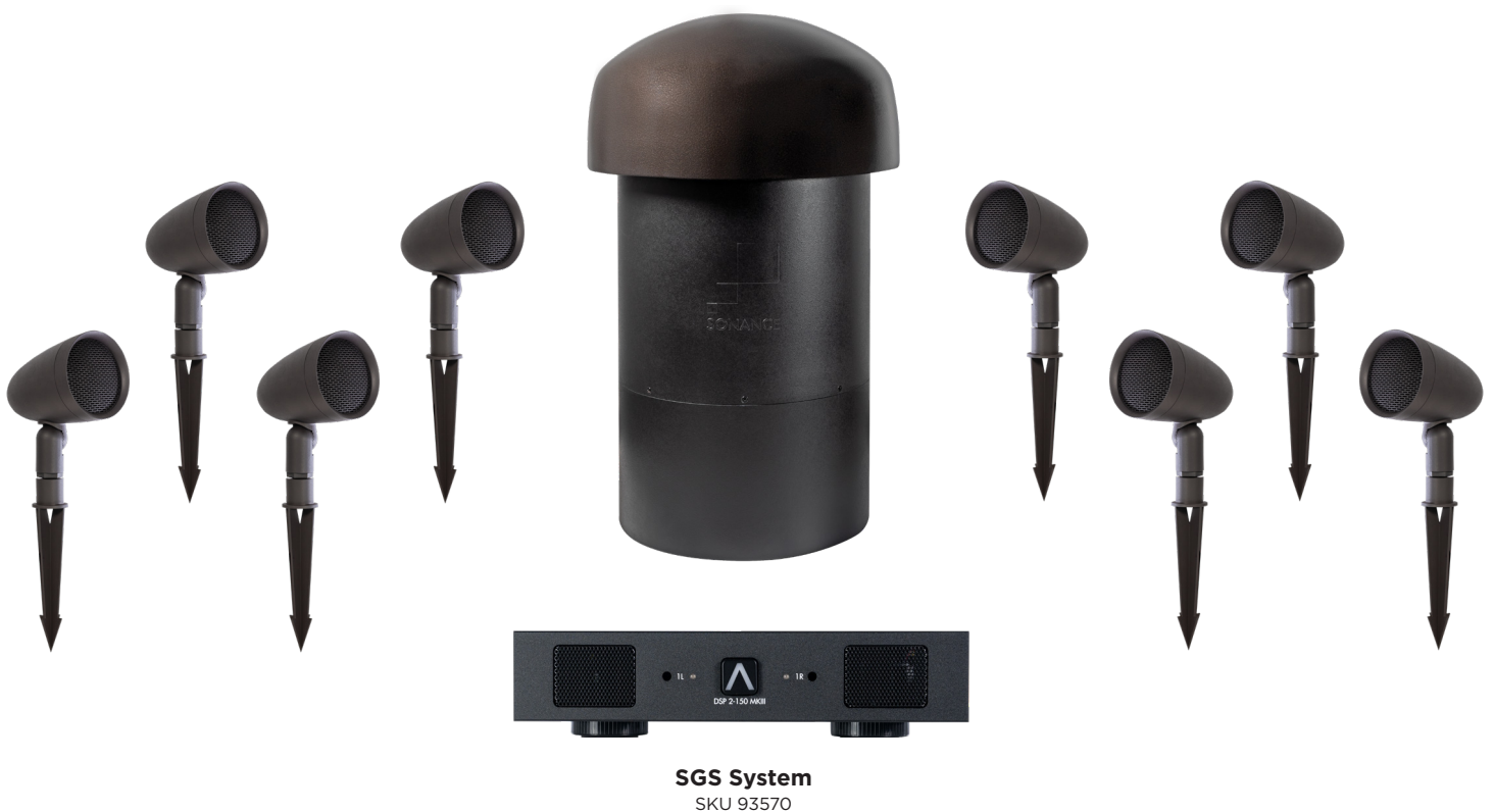
SGS System SKU 93570

Complete 8.1 System configuration on a single two-channel amplifier