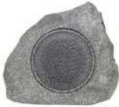
Solar Bluetooth Speaker- 1