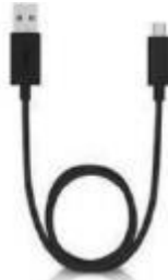
36" USB Charging Cable- 1