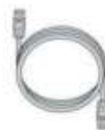
RJ45 Ethernet Cable x1