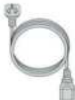
Power Cord x2