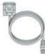
Console Cable x1