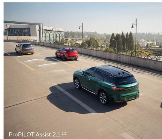
ProPILOT Assist 2.1 1,2

Your life never stops. With new Google built-in , QX60 syncs to your Google Account, so you can easily access your calendar, apps and voice assistant while driving. New wireless Android Auto™ ensures a hassle-free connection to your compatible Android™ smartphone. 3,4,6 Immerse your guests in the premium sound quality of Klipsch® Reference Premiere 20-speaker Audio System . 1 Featuring Individual Audio , the system's speakers in the driver's headrest direct texts and phone calls to the driver alone, while music plays on for everyone else, for a tailored yet shared experience. 1,8