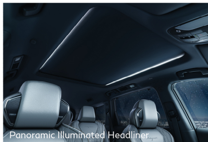
Panoramic Illuminated Headliner