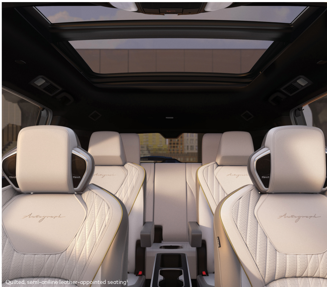
Quilted, semi-aniline leather-appointed seating 1