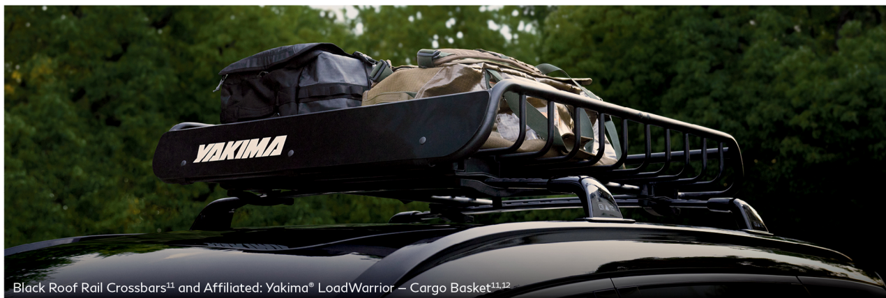
Black Roof Rail Crossbars 11 and Affiliated: Yakima® Load Warrior – Cargo Basket 11,12