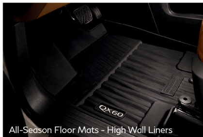
All-Season Floor Mats - High Wall Liners