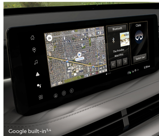
Google built-in 3,4