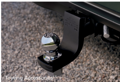
Towing Accessories 13