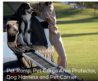
Pet Ramp, Pet Cargo Area Protector, Dog Harness and Pet Carrier

Prep QX60 for any journey. The Underfloor Storage Dividers (set of 2) help keep your belongings hidden and prevent them from rolling around. The Soft Sided Cargo Cooler helps keep food and drinks cool for up to 30 hours.