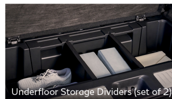
Underfloor Storage Dividers (set of 2)