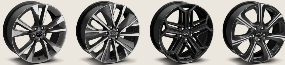
20" machined aluminum-alloy wheels w/ dark silver finish (PURE)