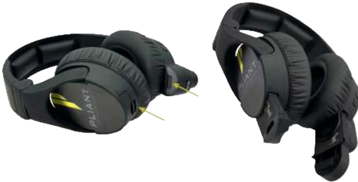
MicroCom HS900XR Wireless Headset Battery Sleds

The batteries are housed within the earcups of the headset. To remove, press the latch/button and pull the battery sled from the earcup. Hold the headset upright for the battery sleds to slide out easier.