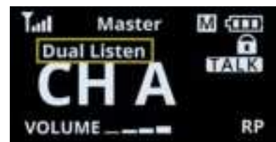
Dual Listen Indicator