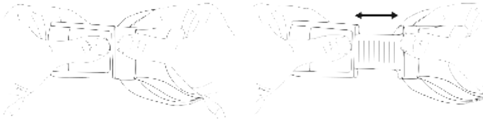
Adjusting Headset Sizing