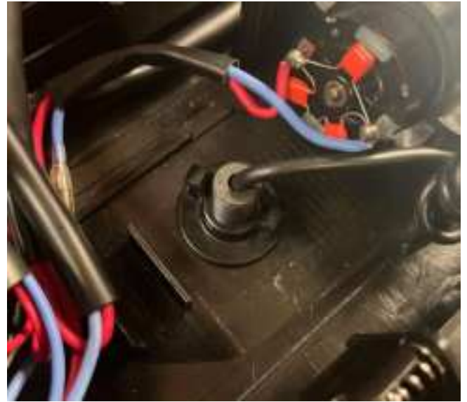
The sonar once fitted inside of the boat