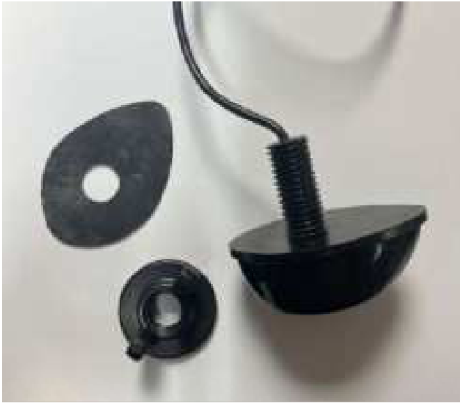
The fish finder sonar with rubber grommet and wing nut