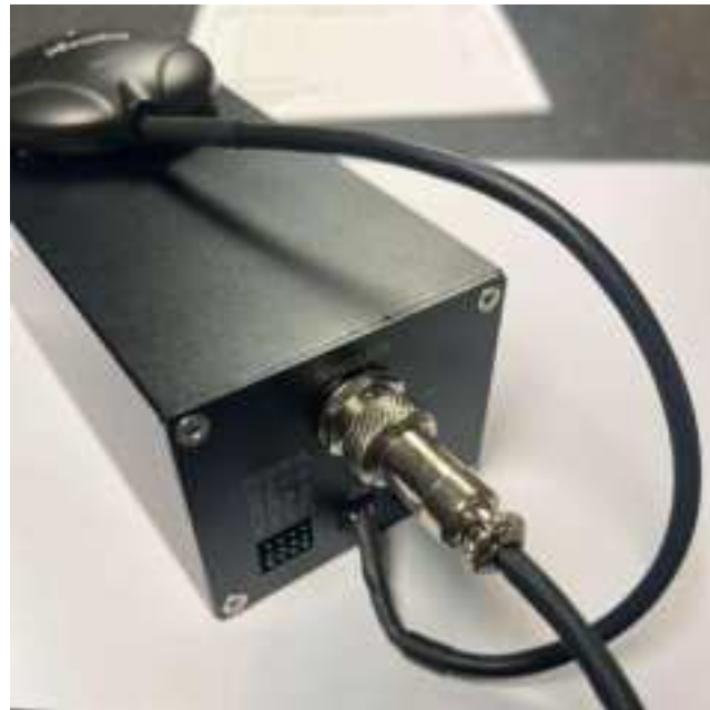
Where to plug the sonar into the back of the autopilot/fish finder receiver box

Now locate the 2 mounting posts either side of the motor Using the brackets and 2 x bolts and allen key provided, mount the large black autopilot receiver box to the 2 mounting posts making sure the GPS module (Newstrong) is facing up, and the power and aerial socket facing the front of the boat.