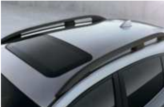
Power Glass Sunroof 4 and Roof Rails