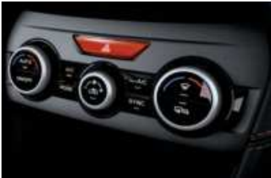
Dual-zone Automatic Climate Control 5