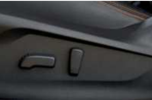
Power Driver Seat 4