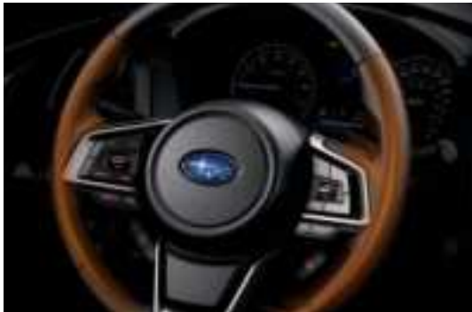
Heated Steering Wheel 6