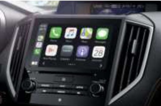
Apple CarPlay ®1,2 / Android ™ Auto 2,3