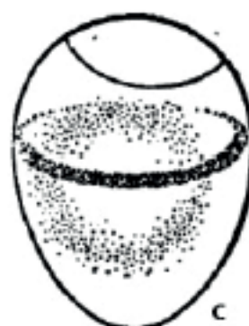
c) Dead embryo