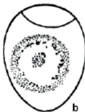
b) Infertile egg