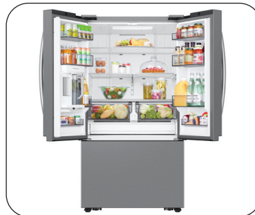
Mega 32 cu. ft. Capacity