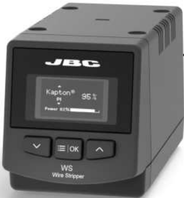
WS High-Temperature Wire Stripper Control Unit