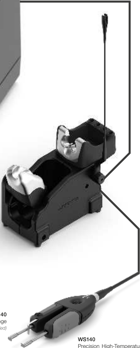
W140 Blade Cartridge Range (not included)