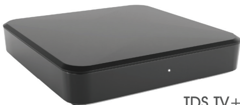
TDS TV+ RECEIVER