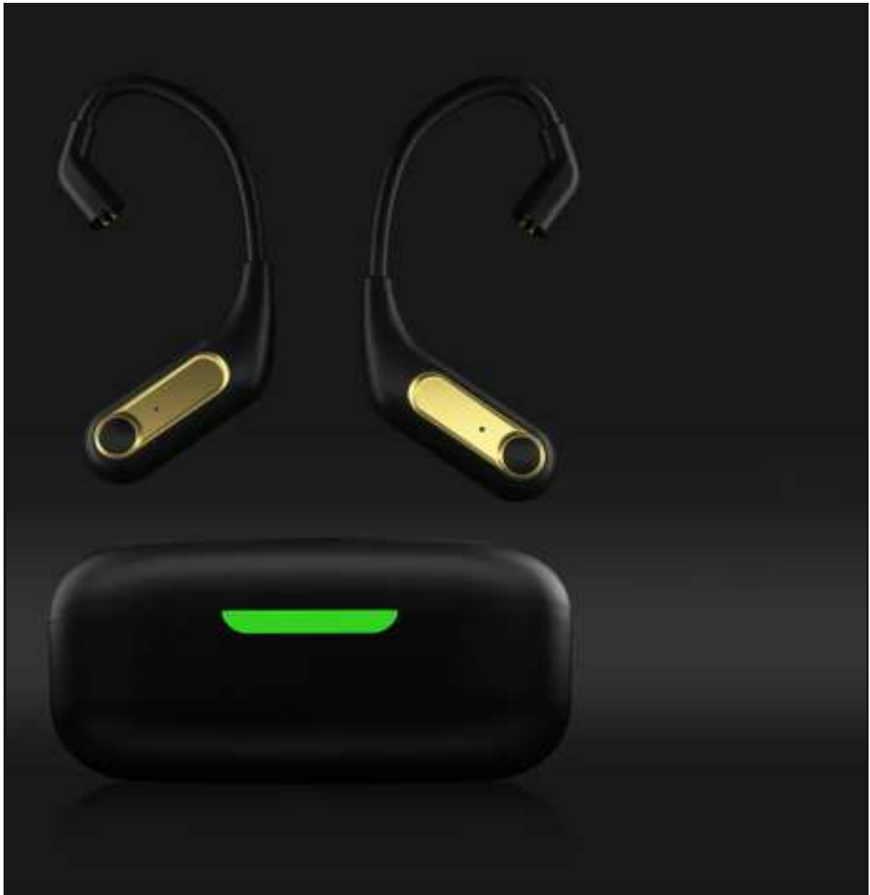
Noise reduction function