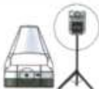
2. Bracket fixing