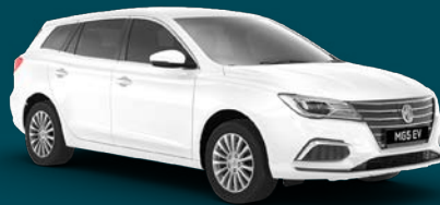
NEW PEARL WHITE