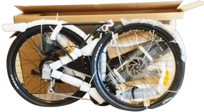
Figure 2: Saddle and separate box with: pedals, charger, and toolkit.

Figure 1: Bike frame, bike box, saddle, additional box of parts (Figure 2), front wheel, axle skewer, and handlebars, all zip tied together and padded.