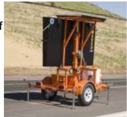
Mini - Travel Position