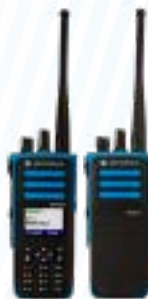
XPR 7550 IS / XPR 7580e IS