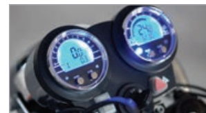
Trip Computer With Odometer