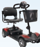
Scout 20 Amp