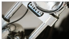
Telescopic Front Motorcycle Suspension For Optimal Handling