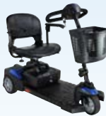
Scout 3 Wheel