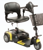
Prism 3 Wheel