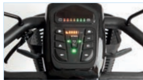
Modern Dash Design