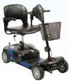
Prism 4 Wheel