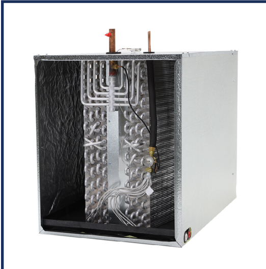
Unit shown with service panels removed. Representative image only. Some models may vary in appearance.