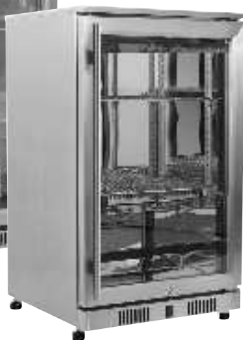
108L CAPACITY Model No: GMF118S

Important: Retain manual for future use.