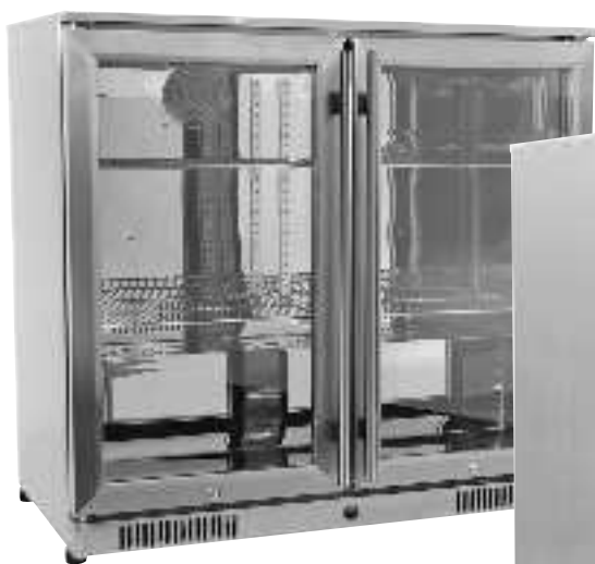
208L CAPACITY Model No: GMF228S