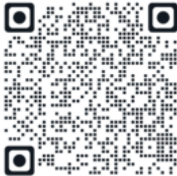
Luoran Facebook Group