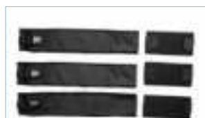
Adaptation set used for assembling BodyMap cushion