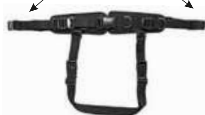
side straps with regulators

Afterwards, insert the two side straps into regulators as explained below. Properly attached belt is shown in the last picture.