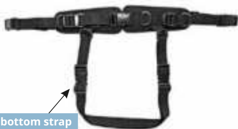
bottom strap with buckles