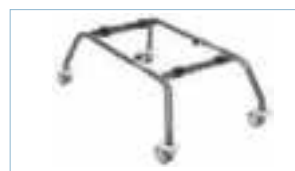
AKVO - Active waterproof platform for bath devices for disabled children