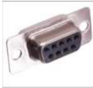
Figure 1 RS-232 data port