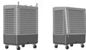
Unscrew the screws in the back panel first, then pull the back panel up.