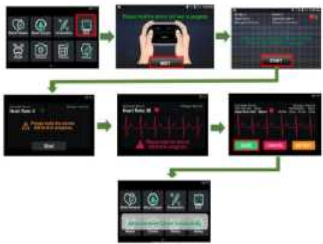
4 Illustrated example of Measuring ECG