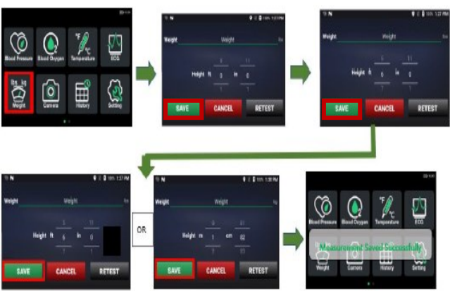
6 Illustrated example of Manually Storing Weight