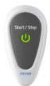
Remote Start / Stop CSGPRSS

Replacing specified Triton accessories for this Omnicare unit will aid optimum performance and keep the unit within the allocated guarantee period