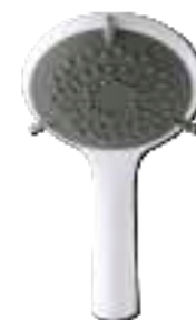
Inclusive Showerhead (5 Spray Pattern) TSHECAREWHT