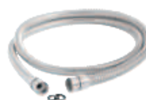
1.5m Anti-twist Hose - Chrome REHOSE150C