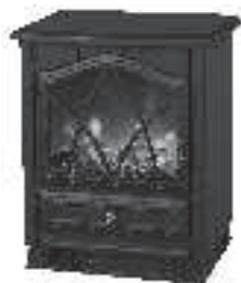
1X Heater body