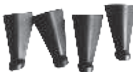
4X Sturdy stable foot