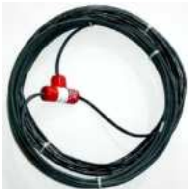
PR-XX with lightning protection built in