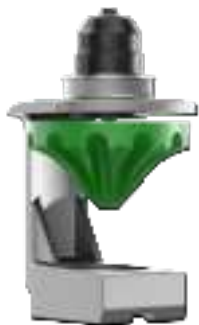
R65i VT Plate/ Body Assy 13771-002